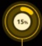
Milestone Burn Fund