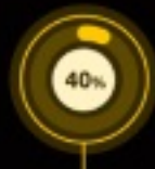
PR and Marketing